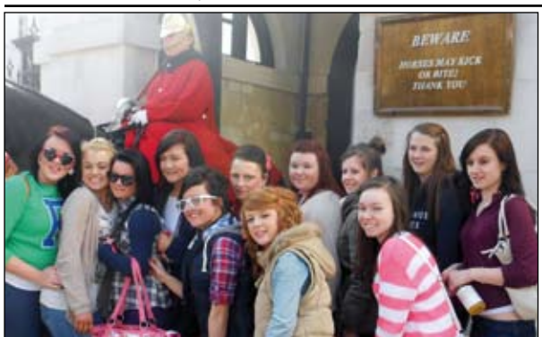
Transition Year students visit London