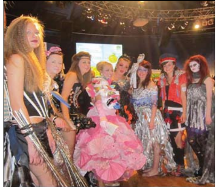
Junk Kouture Recycled Fashion Competition