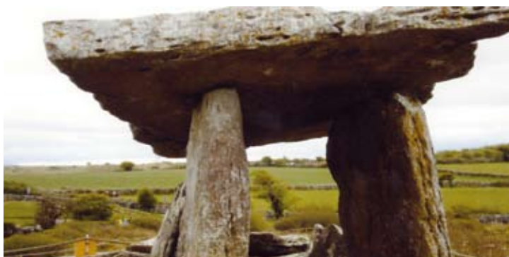
First Year Geography Field Trip to the Burren 2nd May 2012